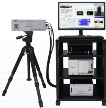
Laser Ultrasonic Visualizing Inspector

Tsukuba Technology Co., Ltd. was founded in July 2005, in the world renowned high-tech science city of Tsukuba, Japan. It is a high-tech venture company originating from the National Institute of Advanced Industrial Science and Technology (AIST).