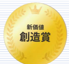
2017 New Value Creation Award