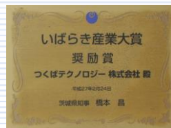
2015 Ibaraki Industry Grand Award