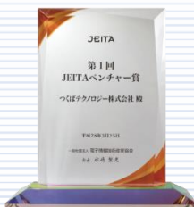
The 1 st JEITA Venture Award