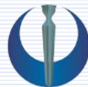
The 6 th Monozukuri Nippon Grand Award